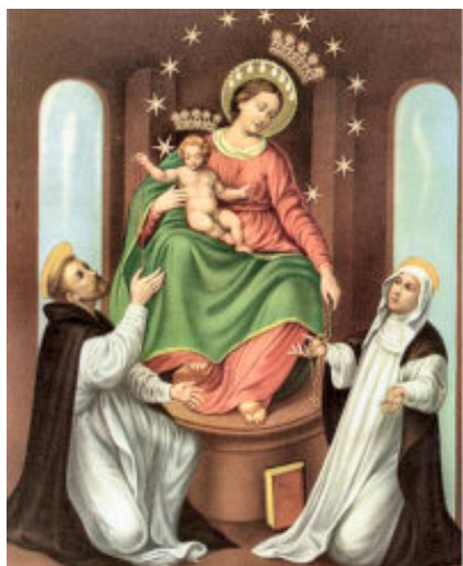
Our Lady of the Rosary, Pray for us!